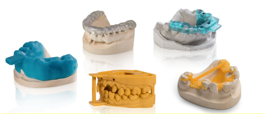
Figure 1: Dental application of 3D printing (from left to right): custom impression trays, bite-raising appliances in clear resin, dental models, surgical stents and frameworks for removable dentures.

3D printing technologies such as stereolithography (SLA), digital light processing (DLP) and selective laser melting (SLM) are mainly used in dentistry. Typical materials used for dental applications are mainly resins or metals, e.g. to fabricate restorations or accessories such as dental models. Figure 1 shows an overview of dental objects, fabricated using 3D printing processes.